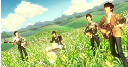
©2009, The Beatles: Rock Band . Image courtesy of Harmonix Music Systems, Inc.