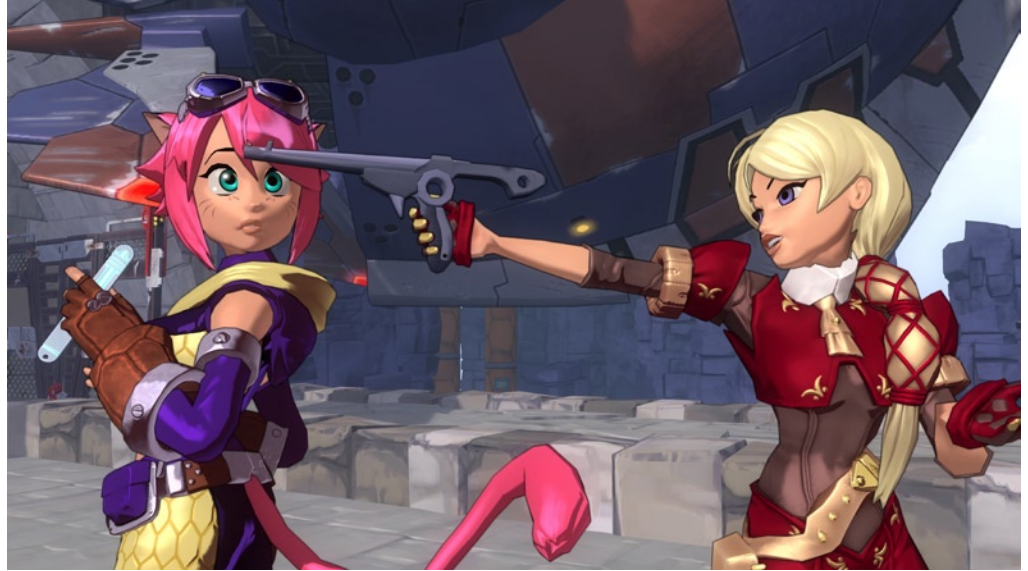
Blade Kitten .

Save time when modeling and maintain focus on the creative task at hand with a new in-context UI for polygon modeling tools that enables you to more interactively manipulate properties and enter values directly at the point of interest in the viewport.