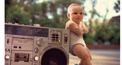
Evian 'Skating Babies,' BETC Euro RSCG.

1 Cutting-Edge CG, Unbeatable Value Help modernize your pipeline from end-to-end, with Autodesk Maya: a state-of-the-art creative solution for 3D modeling, animation, simulation, effects, rendering, matchmoving, and compositing in a single affordable offering. Incorporating innovative dynamic toolsets for cloth, hair, fur, fluids, and particles; the powerful Maya Composite high dynamic range (HDR) compositing system; the Autodesk® MatchMover™ camera tracker; five mental ray® for Maya batch* rendering nodes; and the Autodesk® Backburner™ network render queue manager, Maya offers tremendous value. Maya software's award-winning technology helps artists, designers, and 3D enthusiasts around the world create more engaging and compelling digital imagery, stylistic designs, believable animated characters, and extraordinary visual effects.