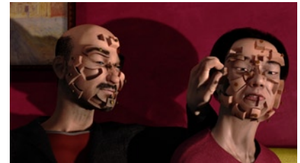
The Spine.

When a production requires more than an out-of-the-box solution, Autodesk's custom development center is standing by with a range of offerings, including custom code development, on-demand bug-fixing (even on prior versions) and a Production Assurance menu of services that will allow customers to get precisely the help they need, when they need it most.