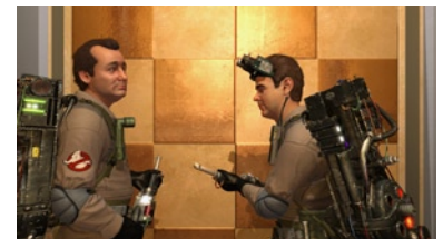
Ghostbusters™: The Video Game.

4 Productivity Increased competition and tighter deadlines, combined with higher audience expectations for quality, mean that many productions require artists to produce more creative output in less time than ever before. Maya helps maximize productivity with optimized workflows for everyday tasks, opportunities for collaborative, parallel workflows and re-use of assets, and automation through scripting for repetitive tasks.