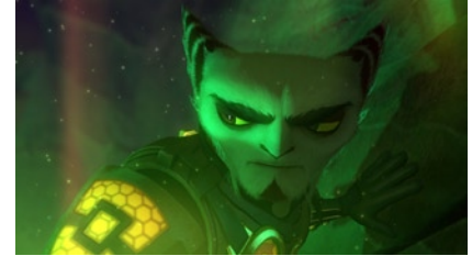
Ratchet and Clank Future: A Crack in Time, Sony Computer Entertainment/Insomniac Games.